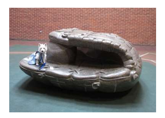
Molly at the Louisville Slugger Museum in downtown Louisville, Kentucky.