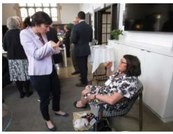
A reception hosted by the college president