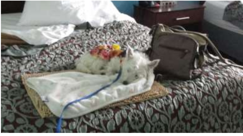
Resting in the motel after a hard day sightseeing.