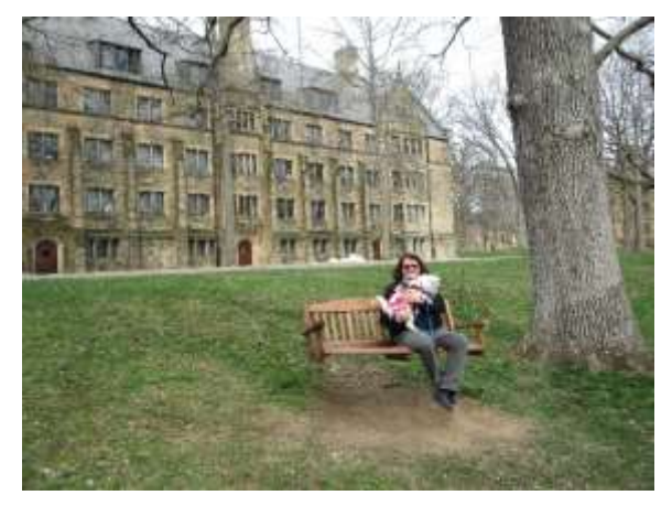
One of the most beautiful college campuses in the US