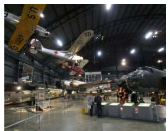
Many acres of planes, displayed indoors. Excellent historical displays, charts, and films of important air military history.